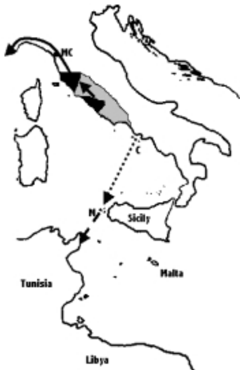
Figure 1. The study area (C = Capri, M = Marettimo, MC = Mount Colegno; the established breeding areas of the short-toed eagle in central Italy, according to Cattaneo and Petretti (1992) are shown in black, the supposed breeding areas in grey; solid arrow: mostly adults; broken arrow: mostly juveniles; dotted arrow: hypothetical route).

Italy), focusing on the passage of birds belonging to different age classes.