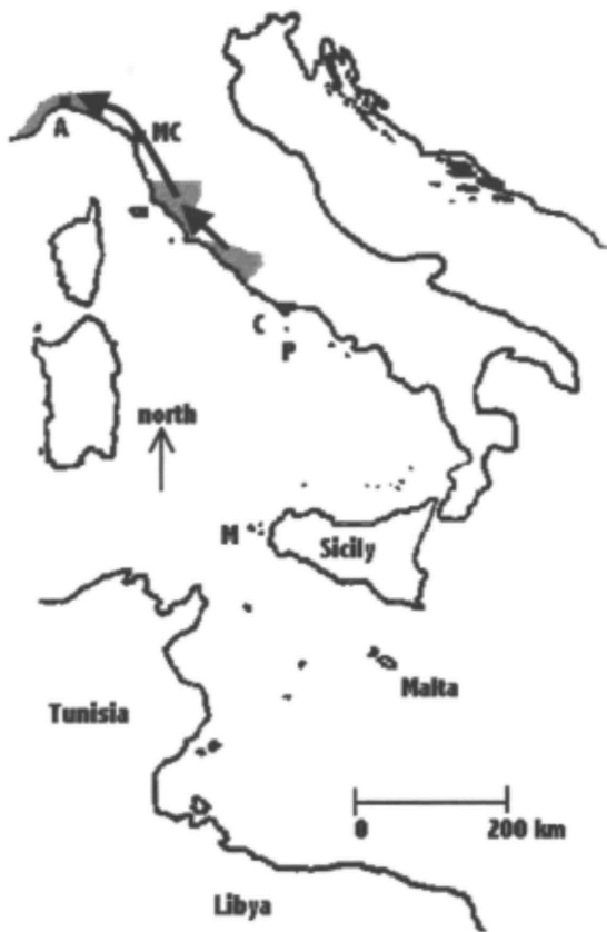
Figure 1. The study area (A = Arenzano, MC = Mount Colegno, C = Circeo promontory, P = Ponza, M = Marettimo; the breeding areas of the Short-toed Eagle in the Ligurian Apennines and central Italy are shown in gray).

probably winter in Sicily (Mascara 1985, Cattaneo and Petretti 1992, Cattaneo 1997, Agostini and Logozzo 1997). In the Mediterranean basin, the greatest concentration of individuals has been observed at the Strait of Gibraltar both during autumn and spring movements (Finlayson 1992).